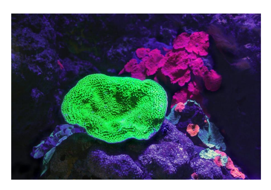
Widely used in pharmaceutics: deep-sea sponges